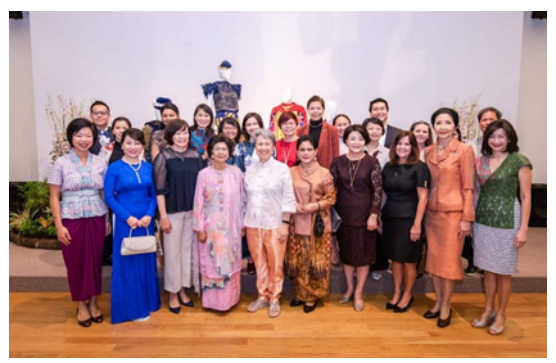
Spouse Programme at the 33rd ASEAN Summit