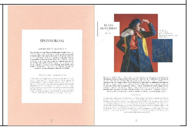
This year, 3 featured designers will be vying for the top prize of the design challenge. They are: